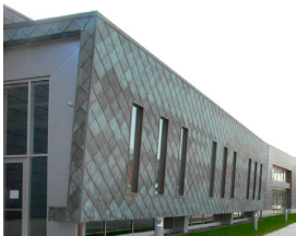
Moline Public Library Moline, IL

Traditional flat seam metal panel look with deeper reveal