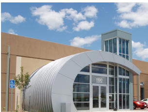
L2 Auto Hiawatha, IA